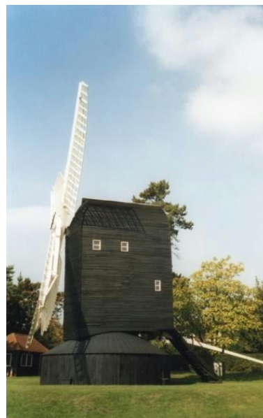
To this; the result of thousands of man hours